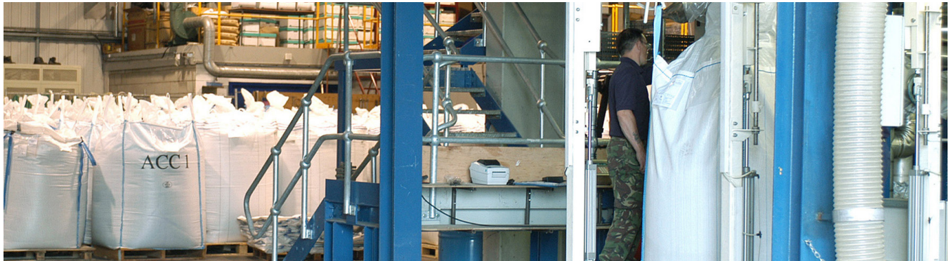
A variety of bulk bags sizes can be handled by the Bulk Bag Filler