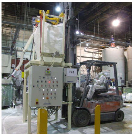
Removing A Partially Unloaded Bag