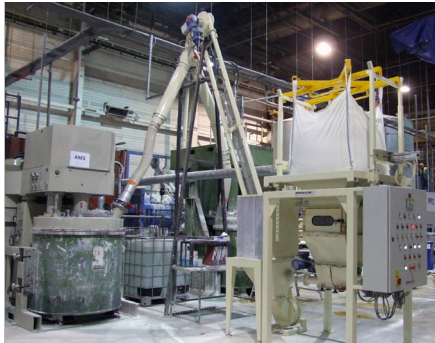
Spiroflow Bulk Bag Unloader & Sack-Tip Station